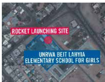
Rocket launching site within an UNRWA school

Thus it is difficult to assess the extent to which senior Hamas officials and commanders were aware of the scope of the destruction and loss of life underway in the Gaza Strip – or in other words, of the cost exacted by the “victim doctrine.” 6