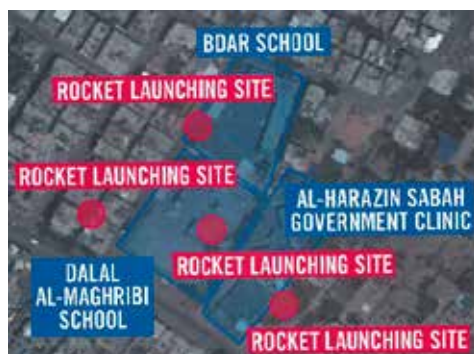
Rocket launching sites within schools