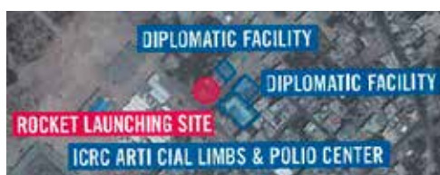
Rocket launching site within a diplomatic facility and a Red Cross medical facility [sic]

In contrast, the IDF’s operational concept underwent no fundamental change since Operation Cast Lead. It was based on firing, including precise standoff firepower against previously selected targets and the intensification of damage to incidental targets. In addition to weapons fire, the IDF maintained the readiness of ground forces to undertake a limited ground incursion into the Gaza Strip, with the aim of destroying the military infrastructure of Hamas and the other armed groups operating in the Strip and of reaching a ceasefire. During Operation Cast Lead, these forces were sent into action after the Israeli airpower campaign had been fully exhausted and failed to bring about a significant reduction in Hamas’ rocket fire. During Operation Pillar of Defense, on the other hand, the Israeli ground force was never utilized due to the relatively quick achievement of understandings and a ceasefire, stemming from Cairo’s influence on Hamas.